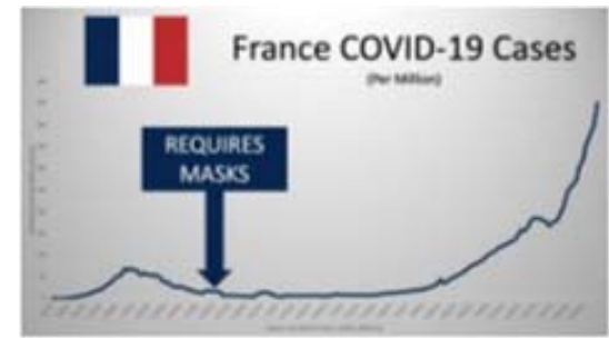
Plaintiff's Exhibit 344